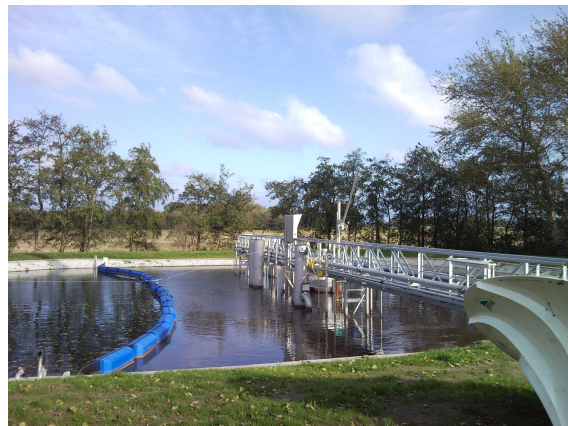
Figure 5: CWSBR® Control Bridge and Hydrosail separating activated sludge zone from clear water zone