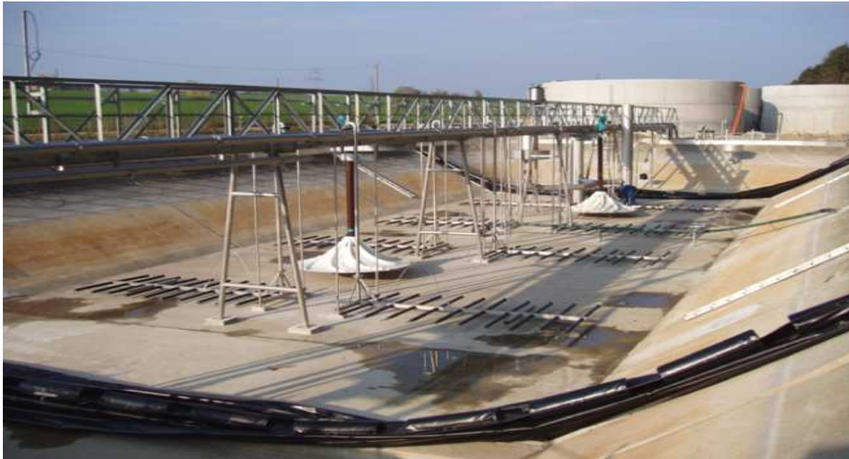
Figure 4: Large CWSBR® Plant under construction

The largest CWSBR® plants to date have been built in China for up to 210.000 population equivalents (PE). The latest plant was commissioned end of 2010. With the size of those plants the CWSBR® system is now established as one of the world largest built SBR systems, and has found its way from use in rural environments into the wastewater management of big cities. The decision to construct large size plants was naturally made in China where pond technologies have a long tradition. The next plant with a capacity of 130.000 PE was ordered recently and is currently in the design stage. As already established for the smaller plants, the large plants are constantly showing the same treated effluent quality.