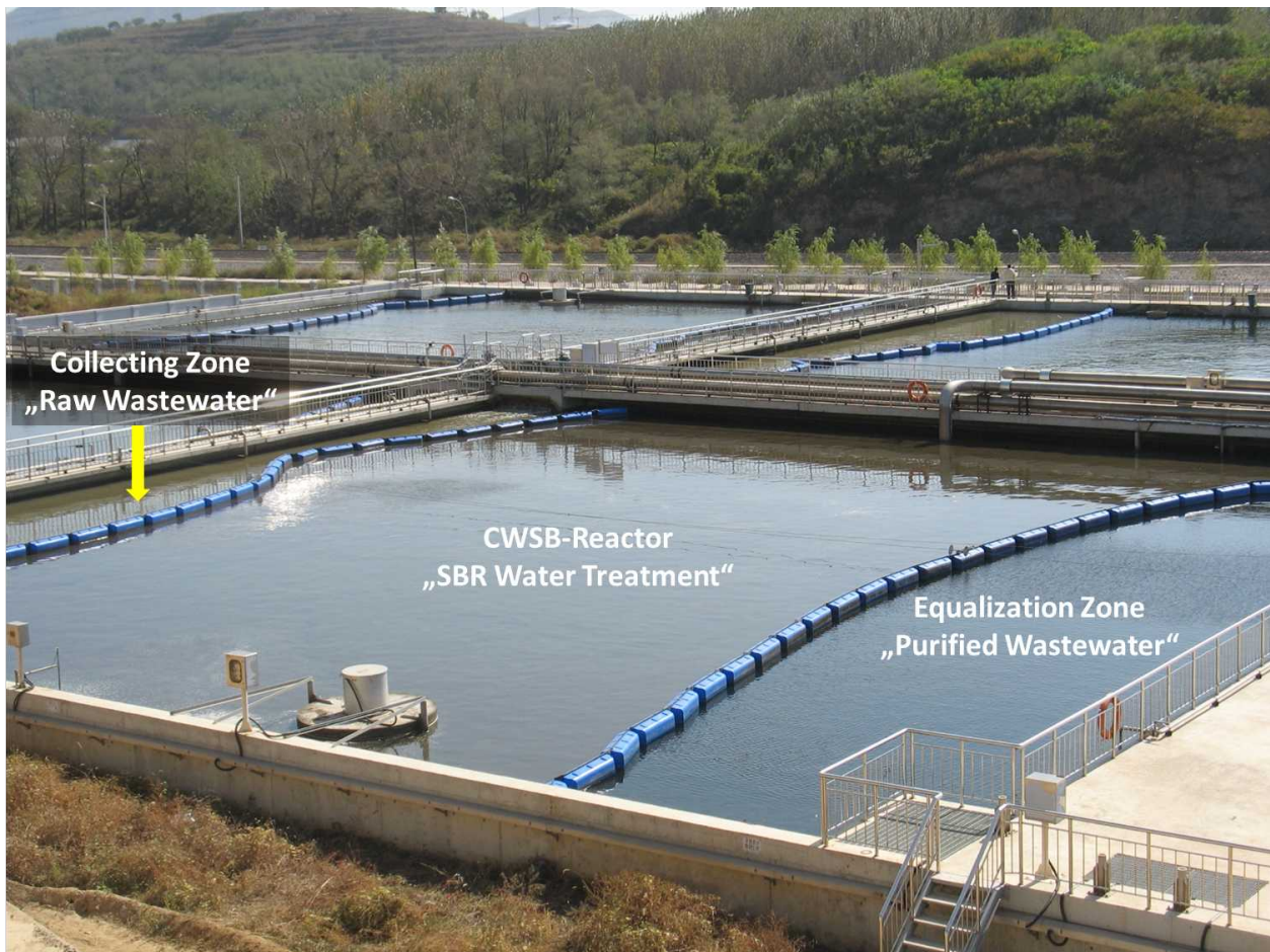
Figure 6: Centralized CWSBR® plant in Xia Jaihe near Dalian, China. The plant (> 100,000 PE) operates involving four modules. Each module contains a Collecting Zone, the CWSB-Reactor and an Equalization Zone. Each module is able to operate as a standalone solution or in combination with the other modules. The modular construction is expandable and adapted on the actual demographic growth of a region.

CWSBR® systems are the first choice when it comes to building new plants or retrofitting and upgrading existing sewage ponds and lagoons to the standards of the largest SBR-plants at low cost. Twelve years experience in building and operating CWSBR® plants have shown that this low price SBR alternative meets all expectations of modern wastewater treatment. CWSBR® applications are now established throughout the world ranging from 800 PE up to 210.000 PE demonstrating that the CWSBR® system and its simple form of construction can be adapted to all rural and municipal waste water treatment applications. The efficiency of wastewater treatment including the elimination of all relevant wastewater components was continuously demonstrated at a high level of reliability.