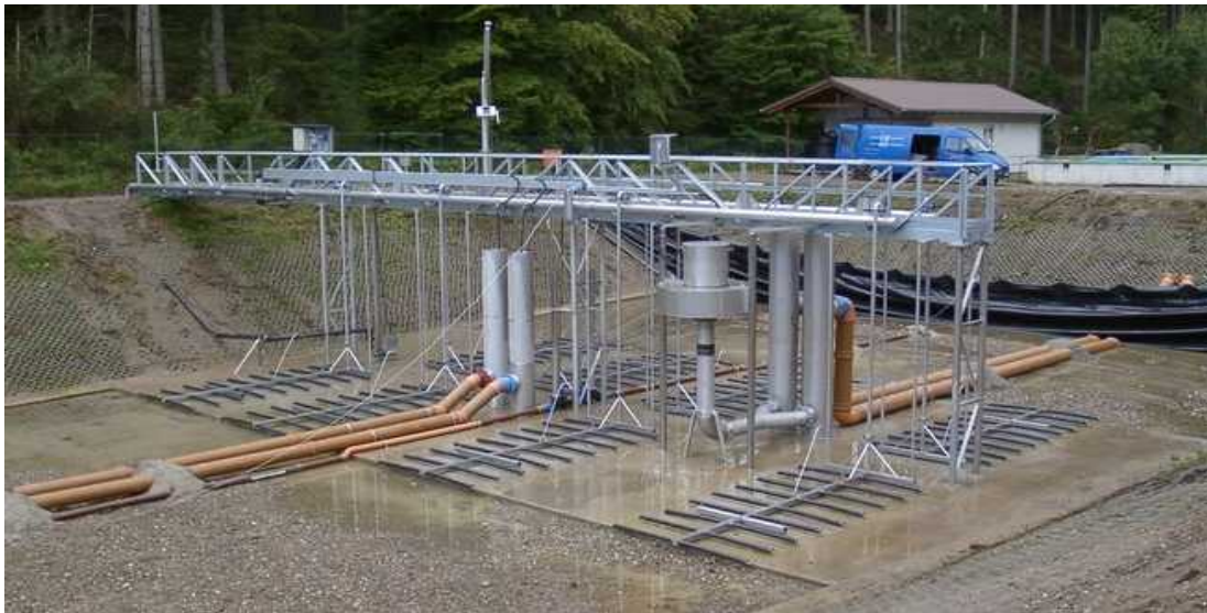
Figure 2: CWSBR® is a full performance SBR process in the shape of a pond technology, which grants highest wastewater treatment standards.

CWSBR® grants full SBR performance including nitrification, denitrification, phosphorus removal by Bio-P and fully stabilized sludge. The attribute typical for SBR technology, highlighting that the treatment success is independent from the plant size also applies for the CWSBR® systems. To date new plants sizing from 800 PE to 210.000 PE were designed and constructed. Upgrades of existing ponds and lagoons were carried out from 5.000 PE to 10.000 PE by retrofitting and extending existing wastewater ponds (figure 2/3).