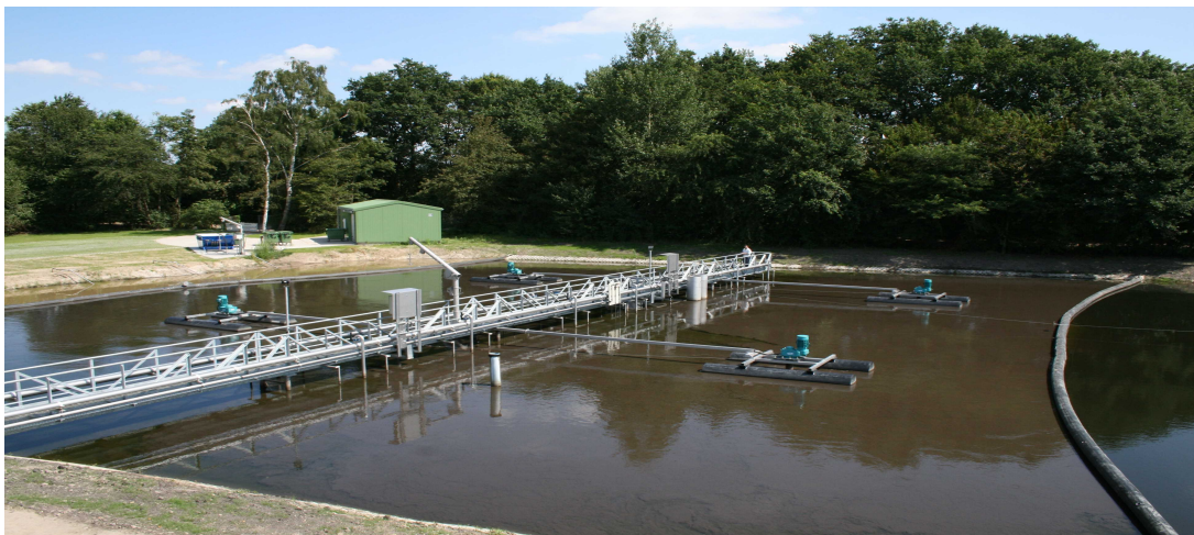
Figure 3: CWSBR® System under running conditions, showing aerated zone.