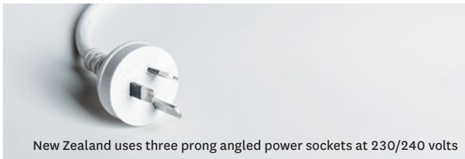
New Zealand uses three prong angled power sockets at 230/240 volts